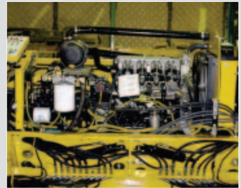
The 56 horse power ISUZU diesel engine is protected by a high water temperature, low oil pressure shut down system.