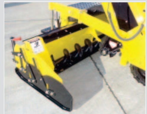
Full floating screed with (2) 30" hydraulically operated, adjustable screed extensions.

With these features and many more, it's easy to see why this model maintains a high residual value while delivering lower lifetime operating costs.