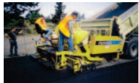
The 4410 Machine paving a side street.