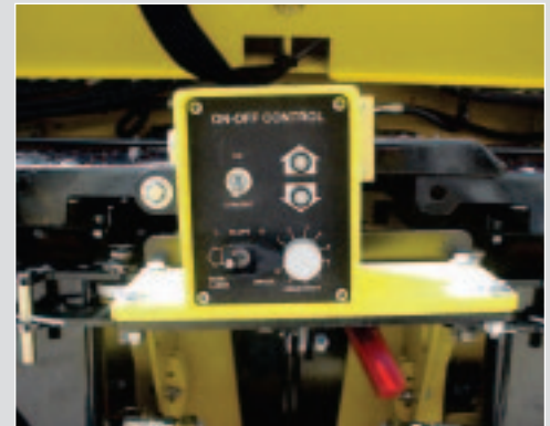
Autodepth option fully controls mat thickness when in the automatic mode.